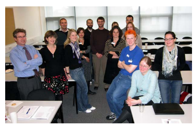
SSCJR and SIPR-funded students attended the 4<sup>th</sup> Workshop in the series of joint seminars for students involved in criminology and policing-related research. University of Dundee, September 09